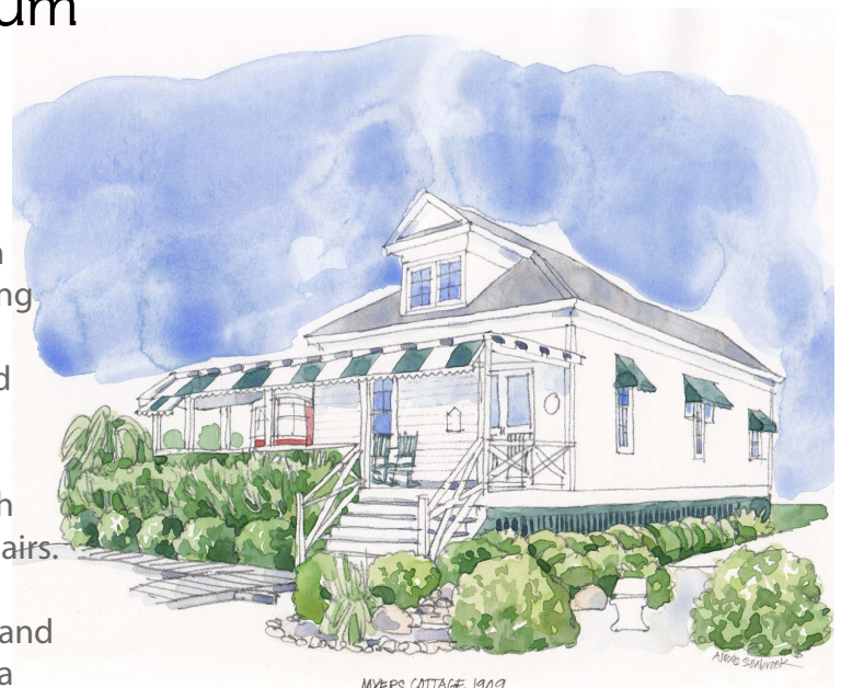
MYERS COTTAGE 1909

Wrightsville Beach has quite a story to tell with a history of post-Civil War sailing regattas and being known as the "Playground of the South" in the 1930s. Walk through the 1909 Myers Cottage and feel what it was like to be at Wrightsville Beach during earlier generations with a bathroom of bathing suits hanging to dry, a kitchen filled with vintage items, and a porch lined with rocking chairs. As part of the permanent display, visitors can explore a shell collection, maps from the 1920s, and a scale model of the beach and its buildings circa