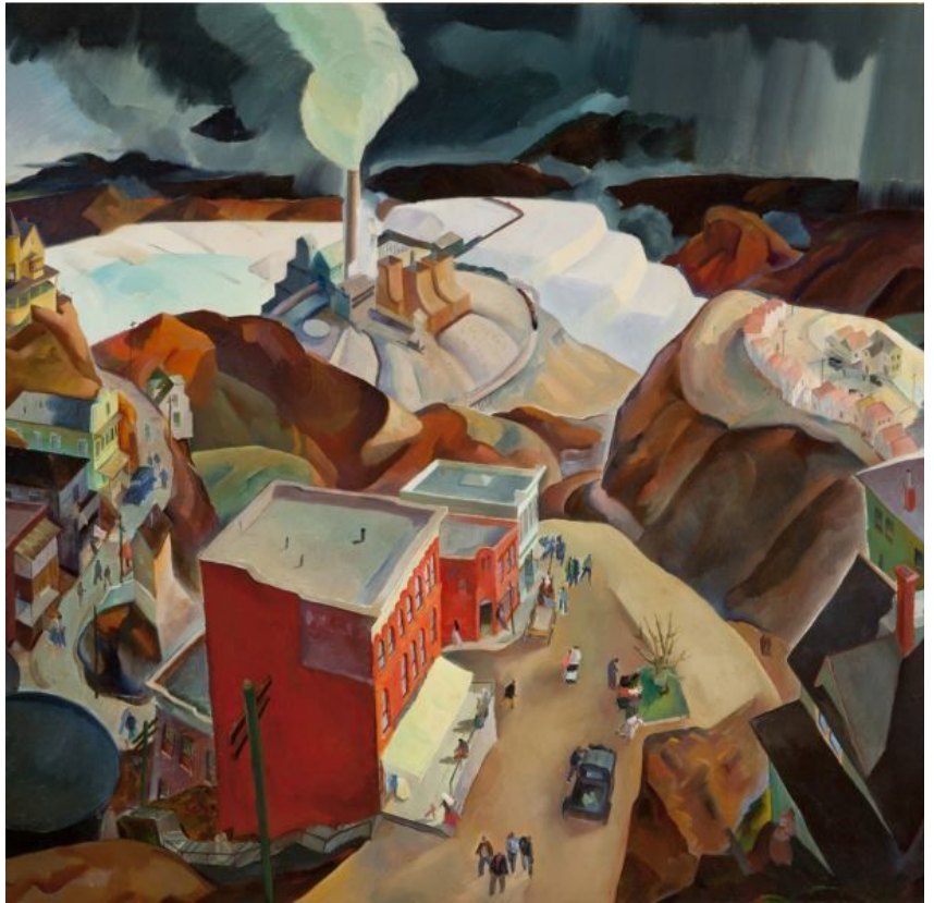
Image credit: Philip Latimer Dike, Copper , 1936. Oil on canvas. Museum purchase with funds provided by Western Art Associates.