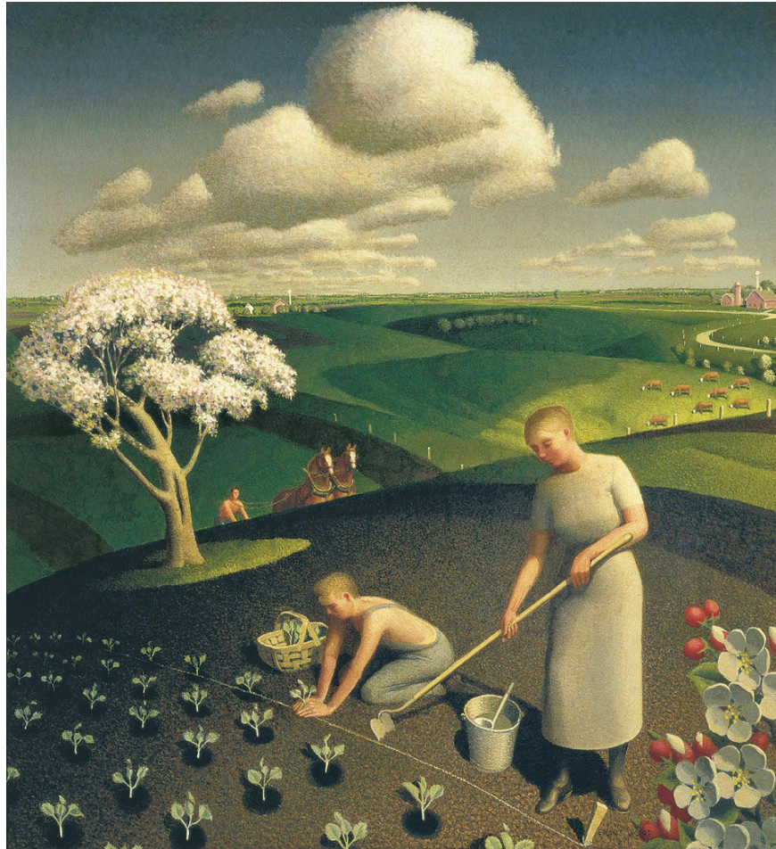
Grant Wood, Spring in the Country, 1941

Presented by the Cedar Rapids Museum of Art