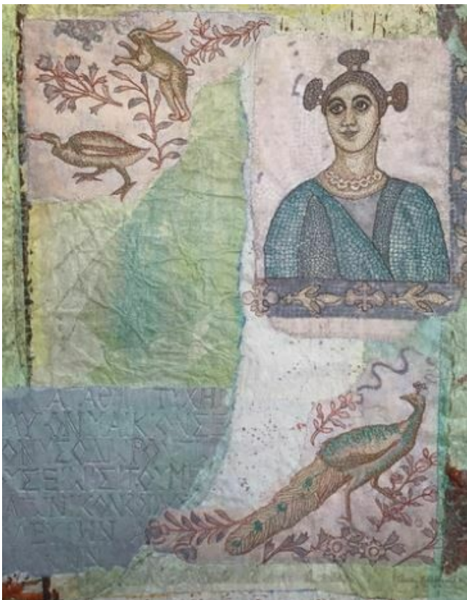
Image: Pauline Fitzgerald, Fragment Series: Lady with a Peacock. (detail), mixed media collage with stitching. 20 x 16 in.

Link: https://sasseartmuseum.org/museum_catalogs.htm