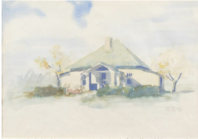
Image: Isabel Robinson, A Home in the Land of the Sky , 1927, watercolor on paper.

Virtually tour the permanent exhibits of the Panhandle-Plains Historical Museum (PPHM) through a new interactive website that features 360 degree images and detailed information spots and videos about the exhibits. The "Virtually Anywhere" tours provide another way for PPHM to be accessible to visitors, as they can visit 15 different locations throughout the museum easily from their computer or mobile device while diving into specially marked artifacts for a look at the extensive PPHM collection.