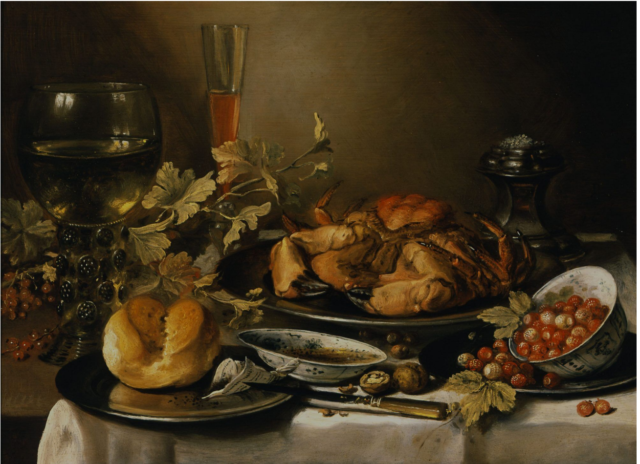
[Image: Pieter Claesz (Dutch), 1597-1661; Still Life, 1657; oil on oak panel]

"European Splendors" offers a chance to re-experience the CMA's Kress Collection — largely off view since 2017 — in a luxurious new way. Featuring an exciting arc of Italian art from the late medieval to the Baroque period shown alongside apothecary mortars and furniture pieces, this exhibition explores the renewed emphasis on the human condition and individualism within religious art and culminates in stunning examples of Dutch portraiture and still life. Italian landscapes by Bernardo Bellotto and Giovanni Paolo Pannini illustrate the impulse to bring a piece of history home from one's Grand Tour as well as the 18th-century mania for Greco-Roman ruins.