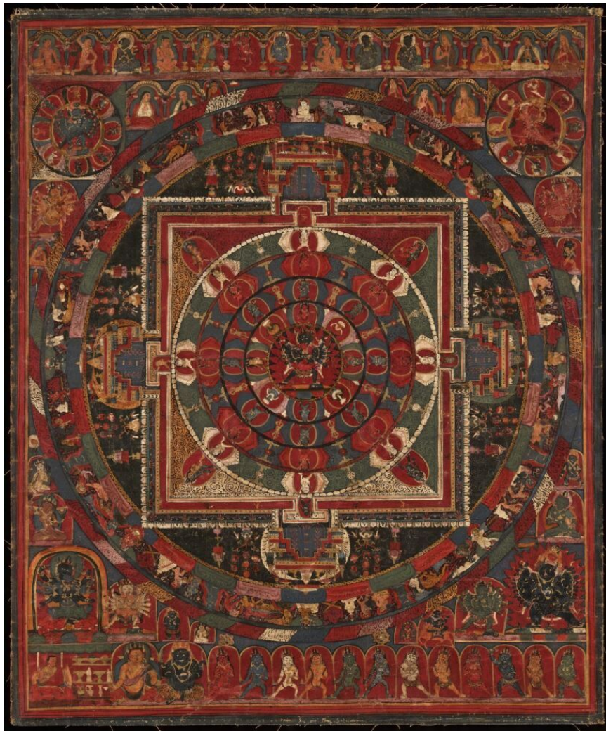
[Image: Mandala of Chakrasamvara, Tibet, 14th-15th century. Pigments on cloth. Mandala of Chakra.]

"Gateway to Himalayan Art" invites you to enter into the art and cultures of the greater Himalayan region—Indian, Nepalese, Bhutanese, Tibetan—and the interrelated Mongolian and Chinese traditions. Much of Himalayan art is informed by Buddhist, Hindu, and native religions, and images play a prominent role in cultural practices.