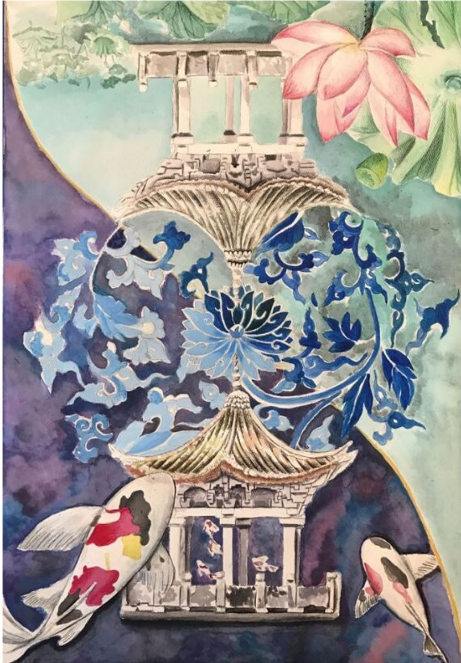
Image credit: Maggie Ma, The Reflection of Yin and Yang. Watercolor, ballpoint pen, acrylic. Cincinnati Country Day High School (11th grade). Teacher: Amy Brand

Virtual Exhibition: Artists Reaching Classrooms [ARC] Presented by the Taft Museum of Art