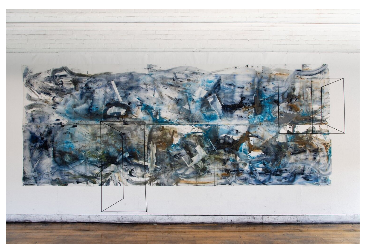
[Image: Cheeny Celebrado-Royer, Untitled I, 2022. Acrylic, tape on drafting film, 96 x 180 inches]

"We Feel Our Way Through When We Don't Know" features the works of Mariel Capanna, Cheeny Celebrado-Royer, Oscar Rene Cornejo, Vessna Scheff, Gerald Euhon Sheffield II, and Lachell Workman. Each artist's contribution demonstrates a particular set of visual strategies centered on forms of abstraction and material process used to realize these works. Liquidity and stain, landscapes built from the accumulation of active marks and tape, logic systems colliding with acrylic medium on a surface, and meticulously selected materials assembled into objects to hold the spirit of a place and/or memory are just some of the moments present to behold. Each work serves as an example of commitment, resourcefulness, and resiliency made through touch and, in return, touching us.